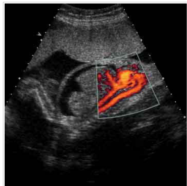
Figure 1 - longitudinal view, abnormal accumulation of serous fluid at the body cavities (pericardial, pleural, or ascitic effusions).