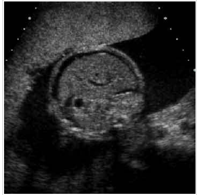
Figure 3 - transverse view, at the stomach and bowel level, with abnormal accumulation of serous fluid at the abdomen or ascitic effusion.